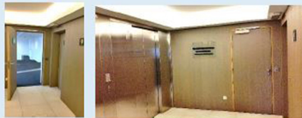
Level +4 Entrance