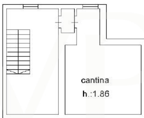
PIANO 1 SOTOSTRADA

This floor plan is not to scale. The documents were given to us by the client. For this reason, we cannot guarantee the accuracy of the information.