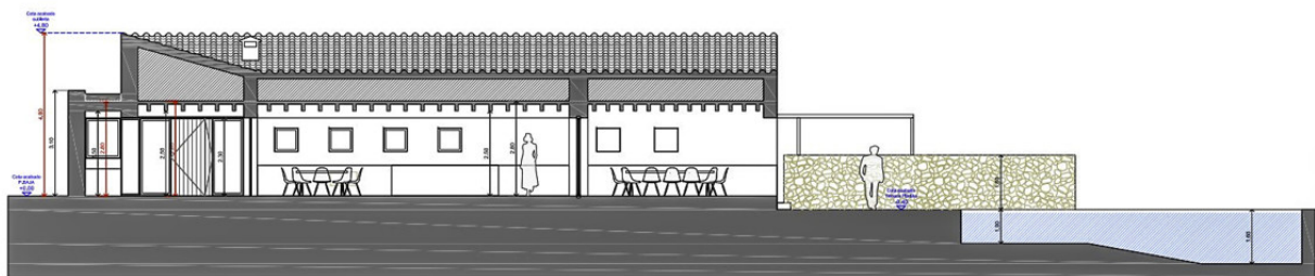
SECCIÓN 1 E: 1/50