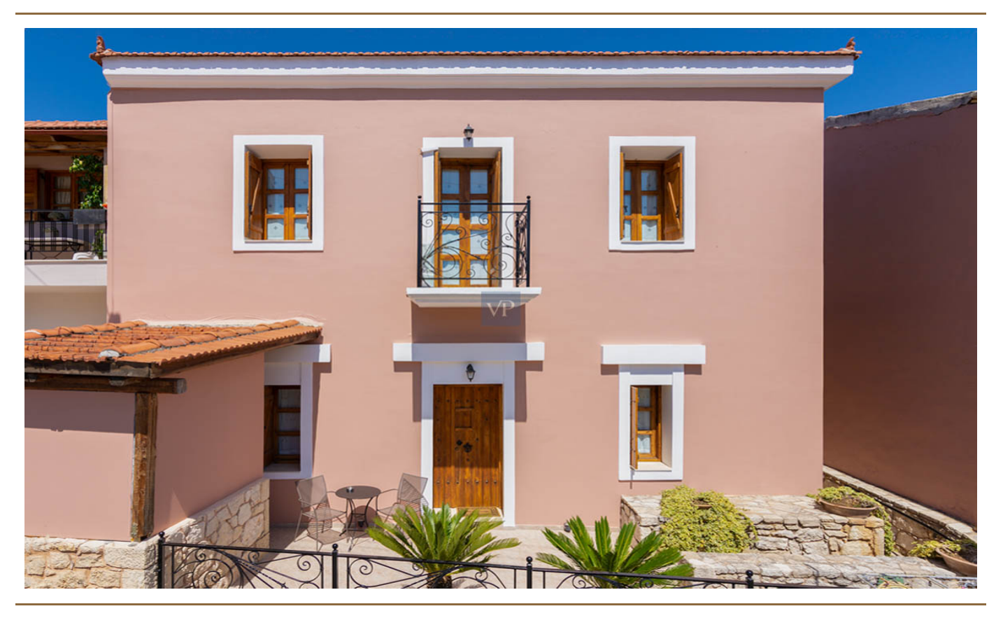
PURCHASE PRICE: 790.000 EUR • ROOMS: 6